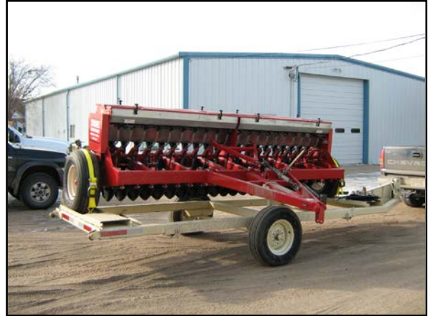
2008 12' Strobel Industries