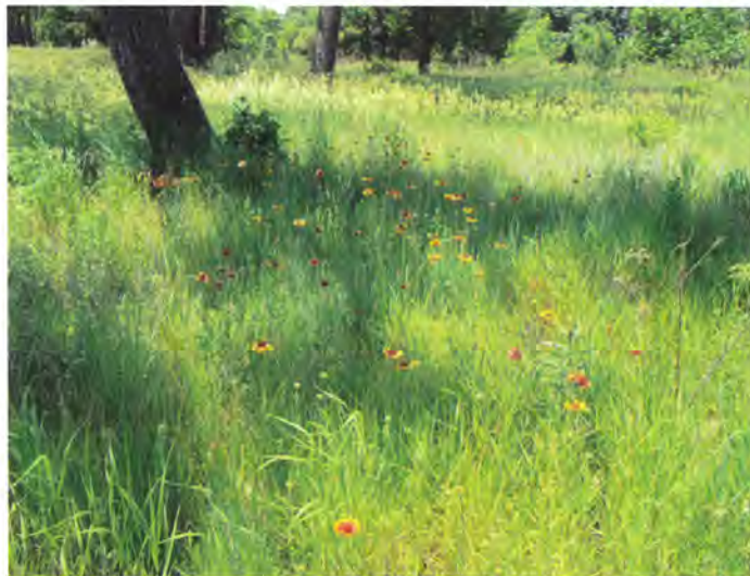
Pictured above is one of the pollinator test plots in Furnas County with grass and flowering plants starting to appear.

One year ago TVWMA planted three pollinator plots along the Republican River in areas that had trees and vegetation removed. These three riparian areas had physical obstacles that were a concern, such as sandy loam soil, 25% tree canopy remained, rough terrain, and tree stumps that still existed. We had to contend with a lot of weedy cover the first year. This spring it was a different story. We do have grass appearing and many pollinators (flowering plants) starting to appear. It was our intent to clip the weed vegetation off the plots this spring, but have decided to just let nature take its course and leave it alone.