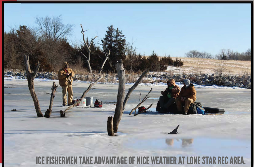
ICE FISHERMEN TAKE ADVANTAGE OF NICE WEATHER AT LONE STAR REC AREA.

Board Orientation will be February 8th to get the new board members up to speed on our authorities and responsibilities, and current state of our NRD. Between board meeting preparation, projects, cost share, orientation, meetings, and communication it has and will be a very busy next couple months.