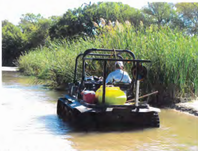
Pictured above is terrestrial spraying of phragmites in Furnas County, just above the Cambridge Diversion Dam

Spraying activities on the river was delayed considerably this year because of high water flows. It appeared like a high infestation of phragmites this year. Harlan Lake was up higher than normal this year which cut down on the amount of exposed shoreline. Terrestrial spraying was completed on the river this year however, because of an early frost; we did not get to all the infested areas off the river.