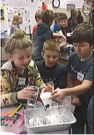
Students test their irrigation system during the Science Olympiad, Feb. 21 in Hastings, Neb.